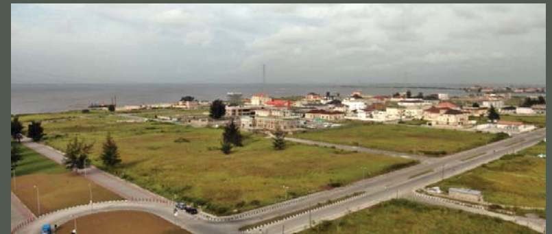
VIEW FROM THE PENTHOUSE